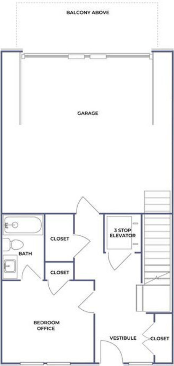
GROUND FLOOR PLAN The Adams interior unit *Optional elevator upgrade