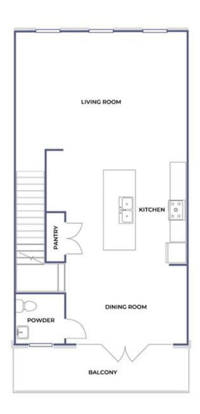
SECOND FLOOR PLAN The Tidwell interior unit